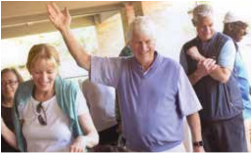
Ready for a fun day!