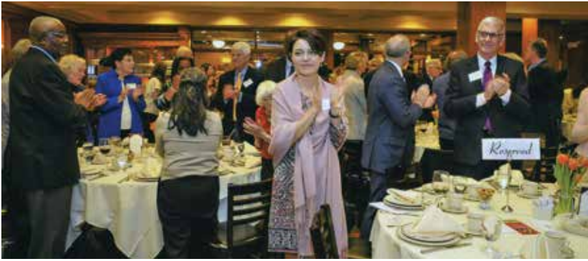
2019 Cherry Scholarship Fund award dinner.